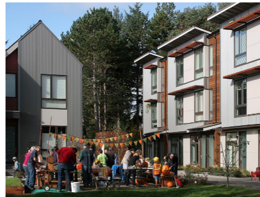
Net density: 20-40 dwellings per hectare