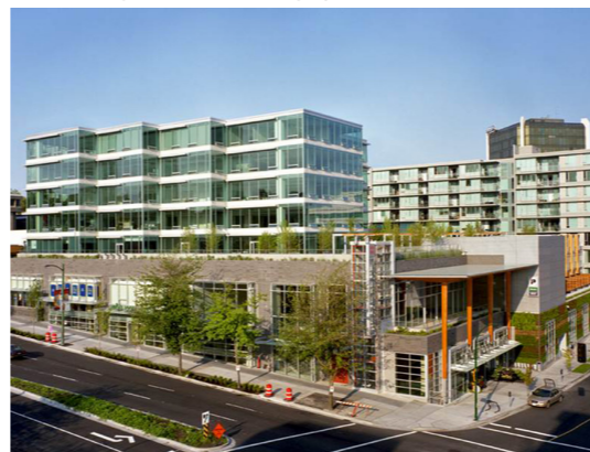
Mixed-use and commercial development