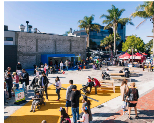
Mixed-use commercial and public realm

Medium density housing serviced by Town/Business Centre comprising freight hub and access to Rapid Transit