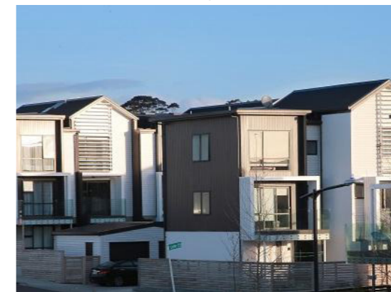
Net density: 45-55 dwellings per hectare