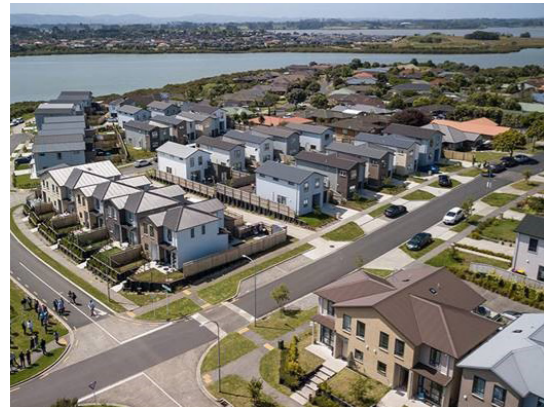
Net density: 30-40 dwellings per hectare