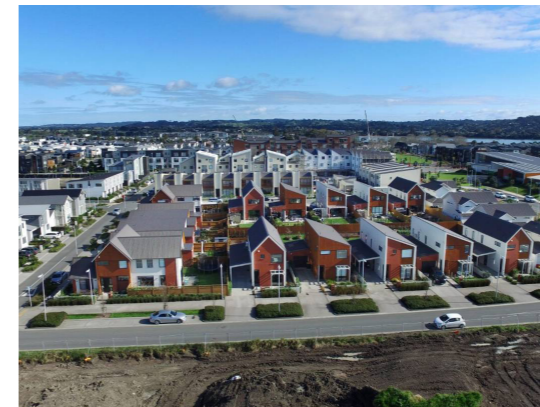
Net density: 30-40 dwellings per hectare