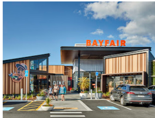
Retail area and public realm