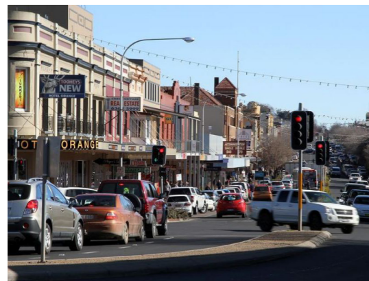
Mixed-use and retail development

Localised greenfield area at medium-low density with access to Town Centre and Frequent Transit