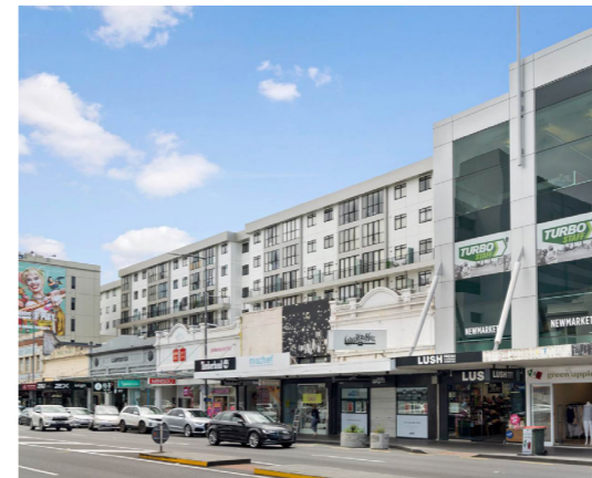
Net density: 20-30 dwellings per hectare