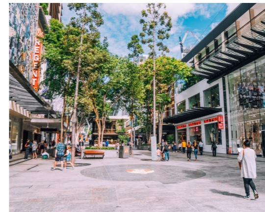
Commercial and retail development

Low-medium residential supported by Town Centre and access to Rapid and Frequent Transit