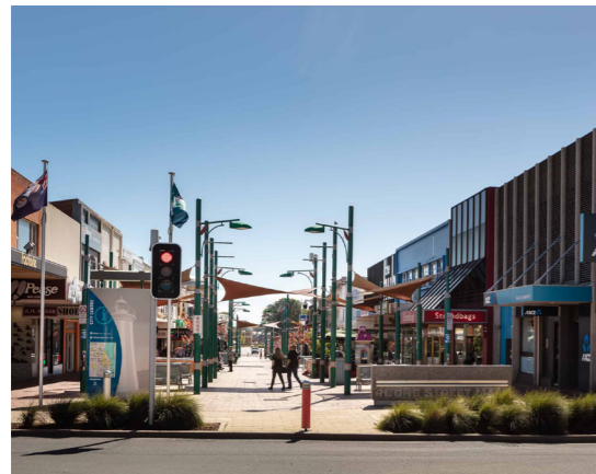
Retail and commercial development

Localised greenfield area at medium-low density with access to Town Centre and Frequent Transit