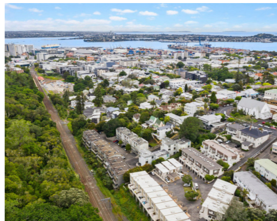
Net density: 25-35 dwellings per hectare

Low density residential within Town Centre, supported by Rapid Transit