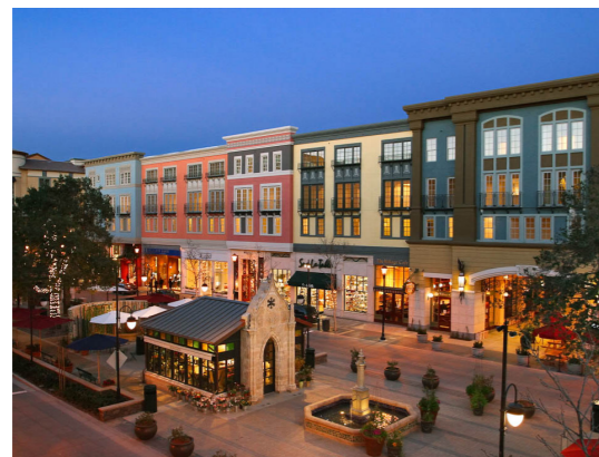
Mixed-use and public realm