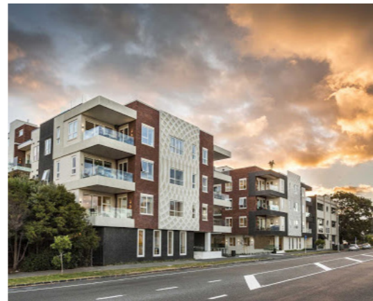
Net density: 40-50 dwellings per hectare

Metro Centre accompanied by medium density residential with access to Frequent Transit