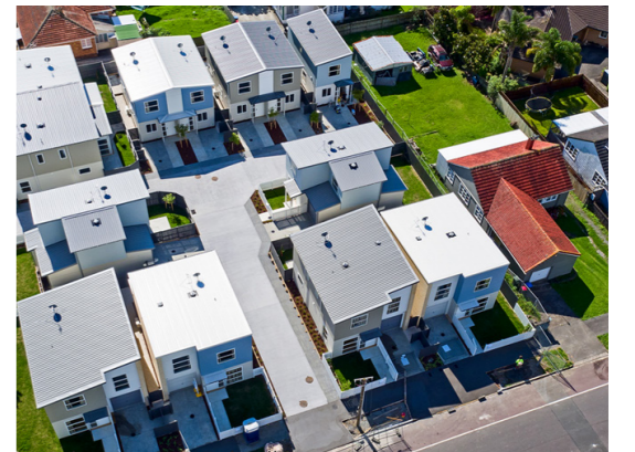
Net density: 35-45 dwellings per hectare