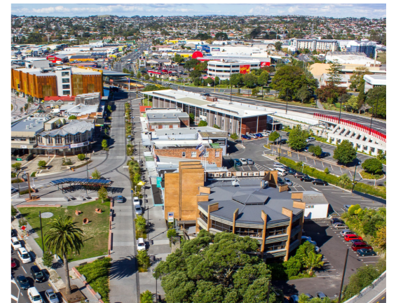
Commercial and business development

Medium density accommodation to support University. Serviced by Specialised Centre and Frequent Transit