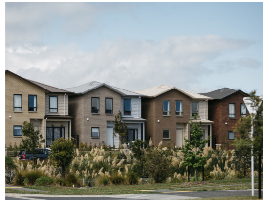
Net density: 35-45 dwellings per hectare