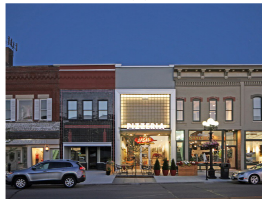
Mixed-use and retail