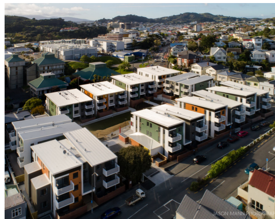
Net density: 40-50 dwellings per hectare

Medium density residential within Metro Centre, supported by Rapid and Frequent Transit