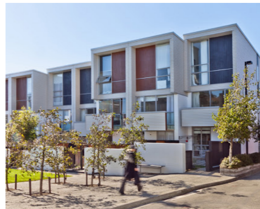
Net density: 30-50 dwellings per hectare

Medium-high density residential within Metro Centre, key employment hub and supported by Rapid and Frequent Transit