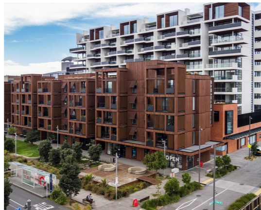
Net density: 150-200 dwellings per hectare

Walkable mixed use high density buildings combined with public spaces. Serviced by Rapid and Frequent Transit