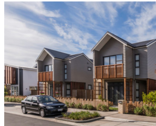
Net density: 20-35 dwellings per hectare