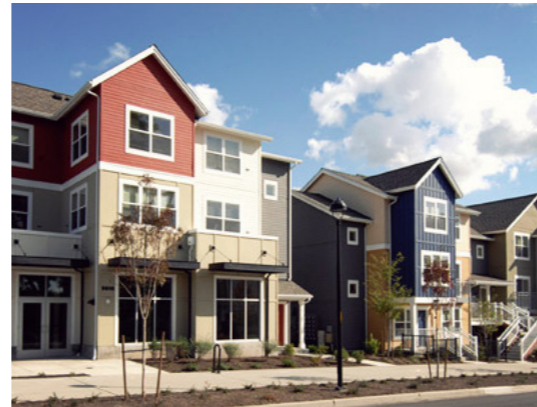
Net density: 35-45 dwellings per hectare