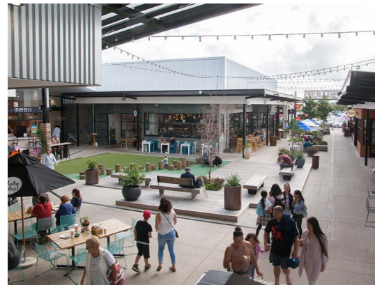
Retail and mixed-use development