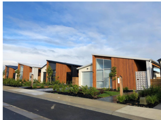
Net density: 20-30 dwellings per hectare