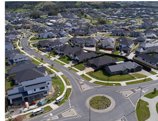
Net density: 20-35 dwellings per hectare