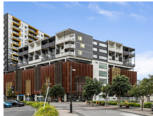
Net density: 45-65 dwellings per hectare