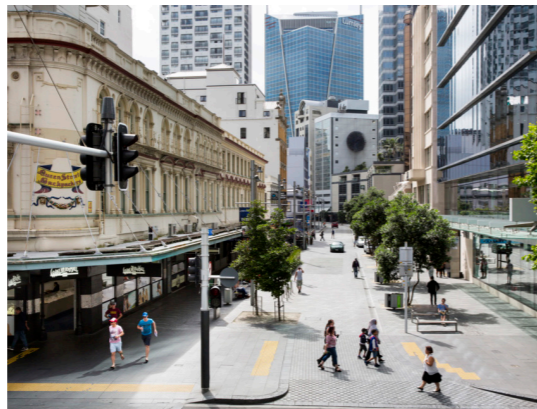
Mixed-use and public realm