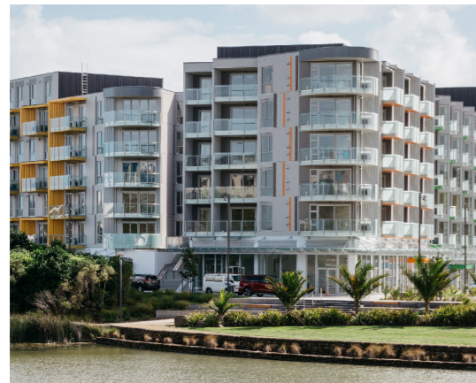
Net density: 60-70 dwellings per hectare

Mixed use medium-high density, close vicinity to Town Centre. Serviced by H2A, Rapid and Frequent Transit