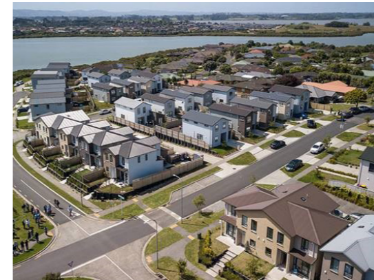
Net density: 30-40 dwellings per hectare