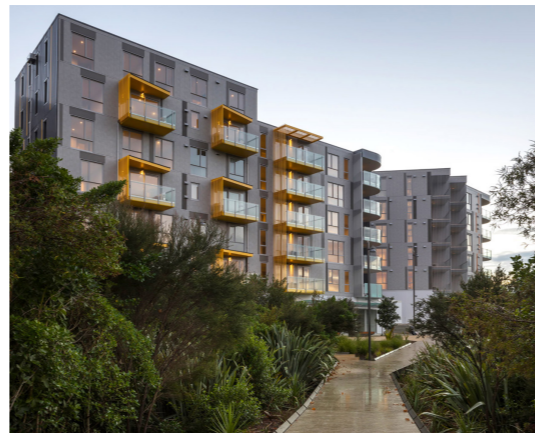
Net density: 55-65 dwellings per hectare

Employment provided by Hospital, supported by mixed use medium density and Specialised Centre.