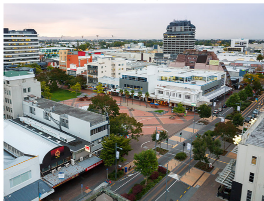
Net density: 20-100 dwellings per hectare