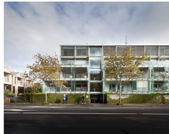
Net density: 40-50 dwellings per hectare

Localised greenfield area at medium-low density with access to Town Centre and Frequent Transit