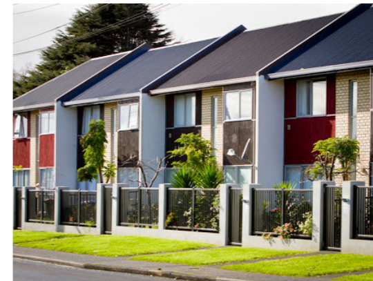
Net density: 30-40 dwellings per hectare