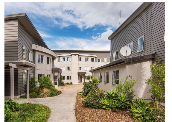
Net density: 35-45 dwellings per hectare