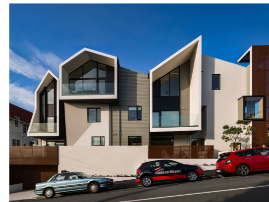
Net density: 30-40 dwellings per hectare