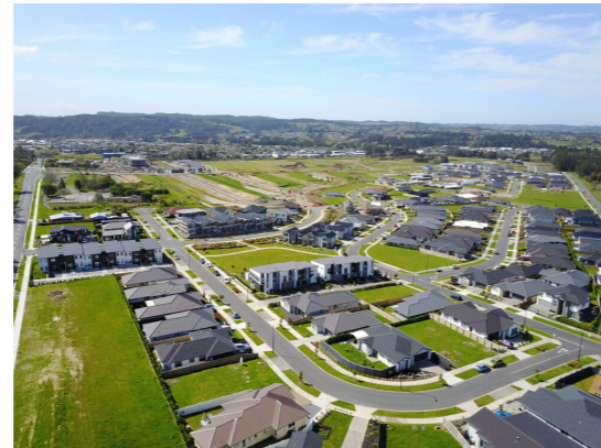
Net density: 30-40 dwellings per hectare