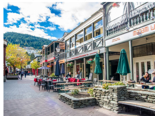
Commercial and public realm