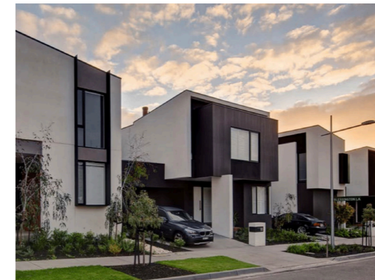
Net density: 40-45 dwellings per hectare