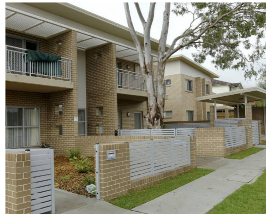
Net density: 35-45 dwellings per hectare