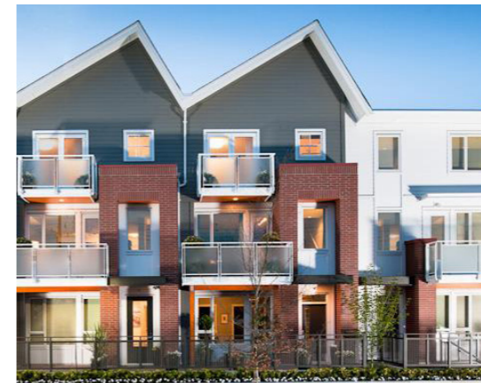
Net density: 40-50 dwellings per hectare

Medium density residential area serviced by Frequent Transit