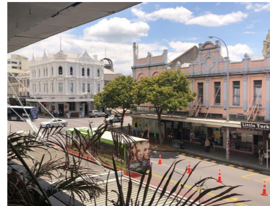
Mixed-use and retail development