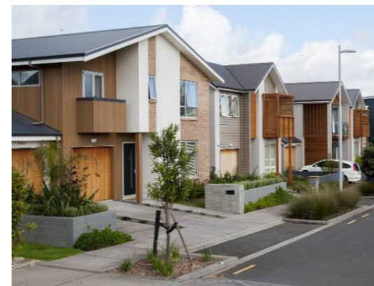
Net density: 25-35 dwellings per hectare

Medium density residential serviced by Metro Centre and Frequent Transit