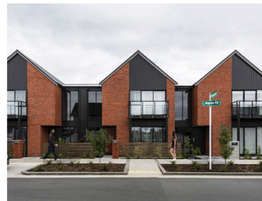
Net density: 25-35 dwellings per hectare

Medium density residential serviced by Metro Centre and Frequent Transit