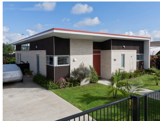
Net density: 30-40 dwellings per hectare