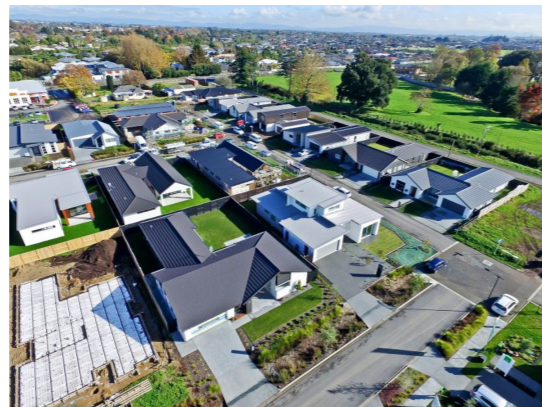
Net density: 15-25 dwellings per hectare